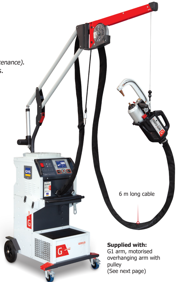
6 m long cable

Supplied with: G1 arm, motorised overhanging arm with pulley (See next page)